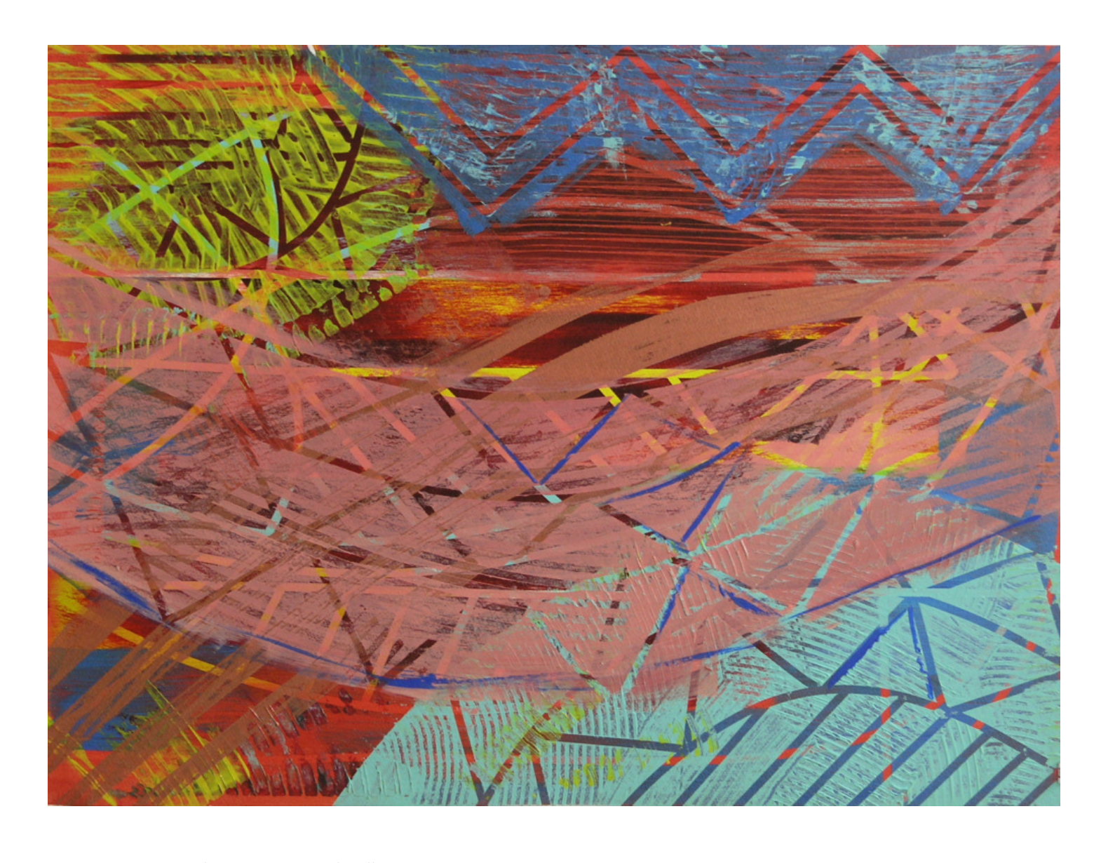
Figure 2: On the Edge of a Sword, 2007, acrylic and pigment on 300lb watercolor paper, 22"x30"