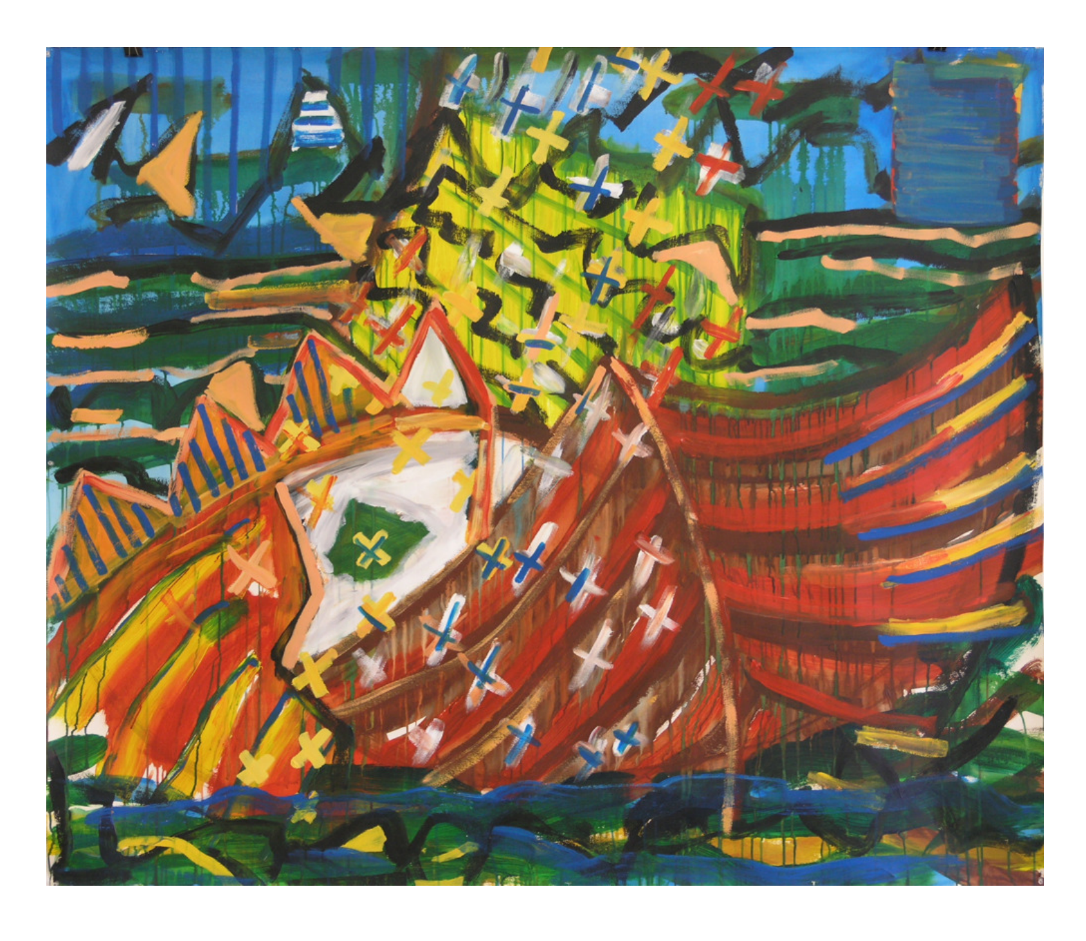
Figure 6: Lost Kings, 1989, acrylic on paper, 60"x72"