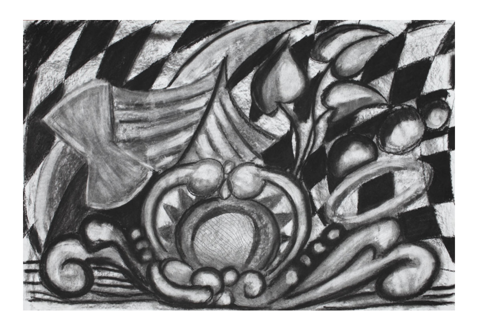
Figure 8: Crossings, 2014, charcoal on paper, 24"x36"