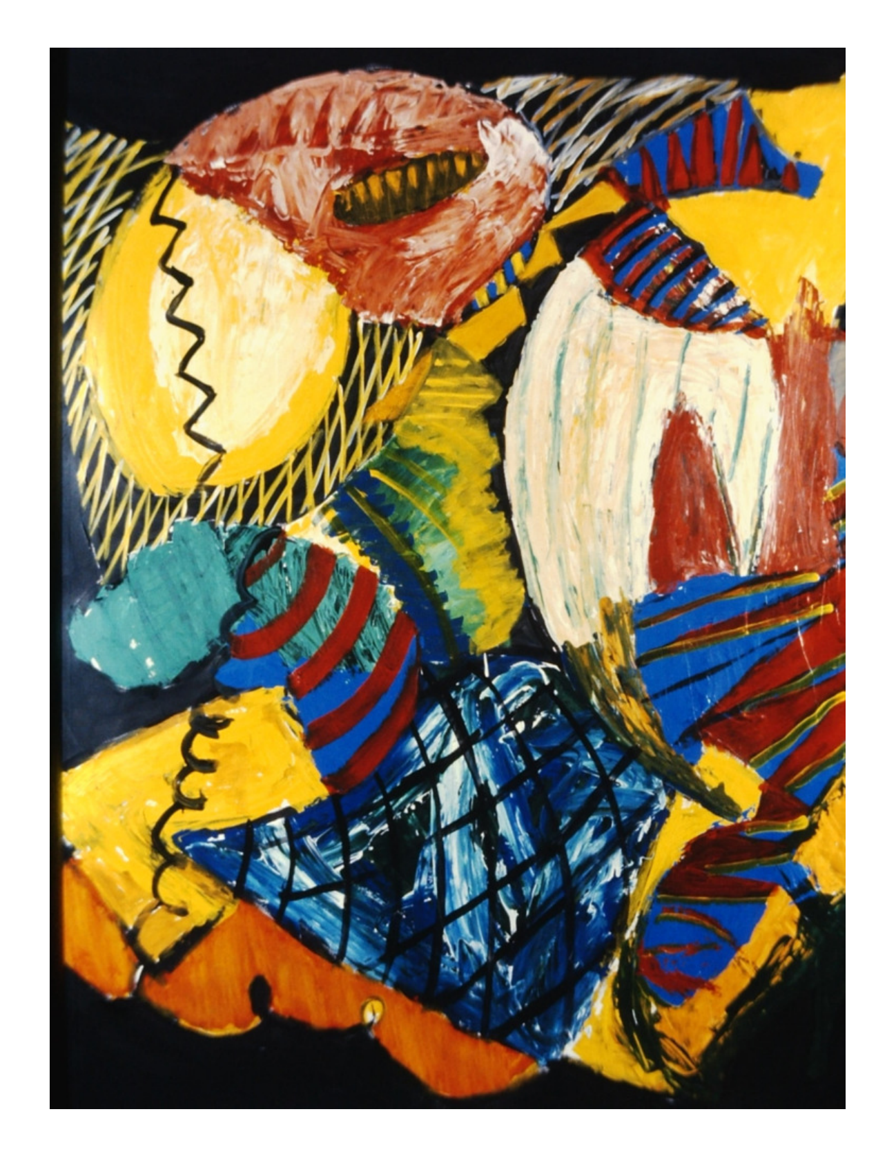
Figure 10: Astro Black, 1992, acrylic on paper, 74"x60"