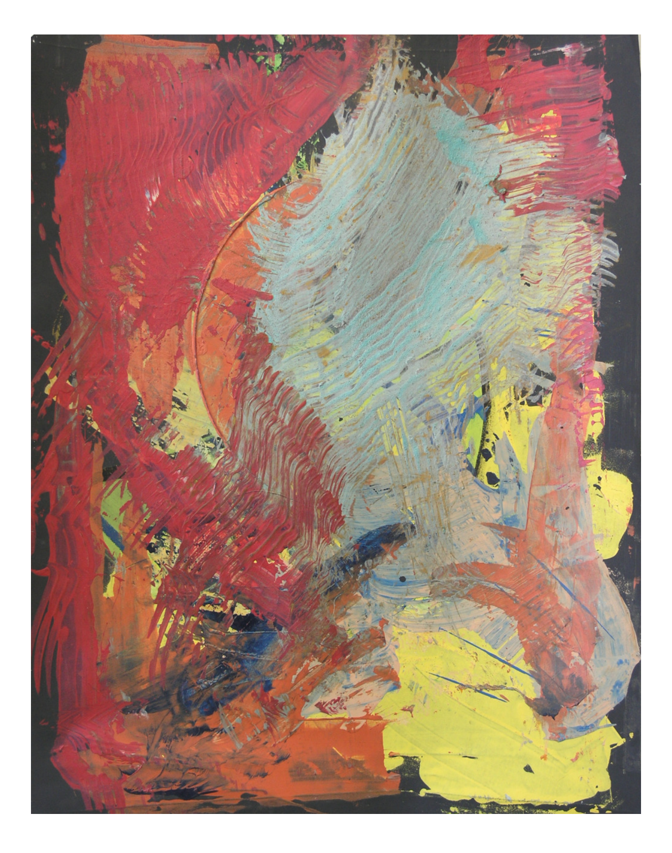
Figure 1: Mississippi Burning, 2005, acrylic and pigment on vinyl, 54"x40"