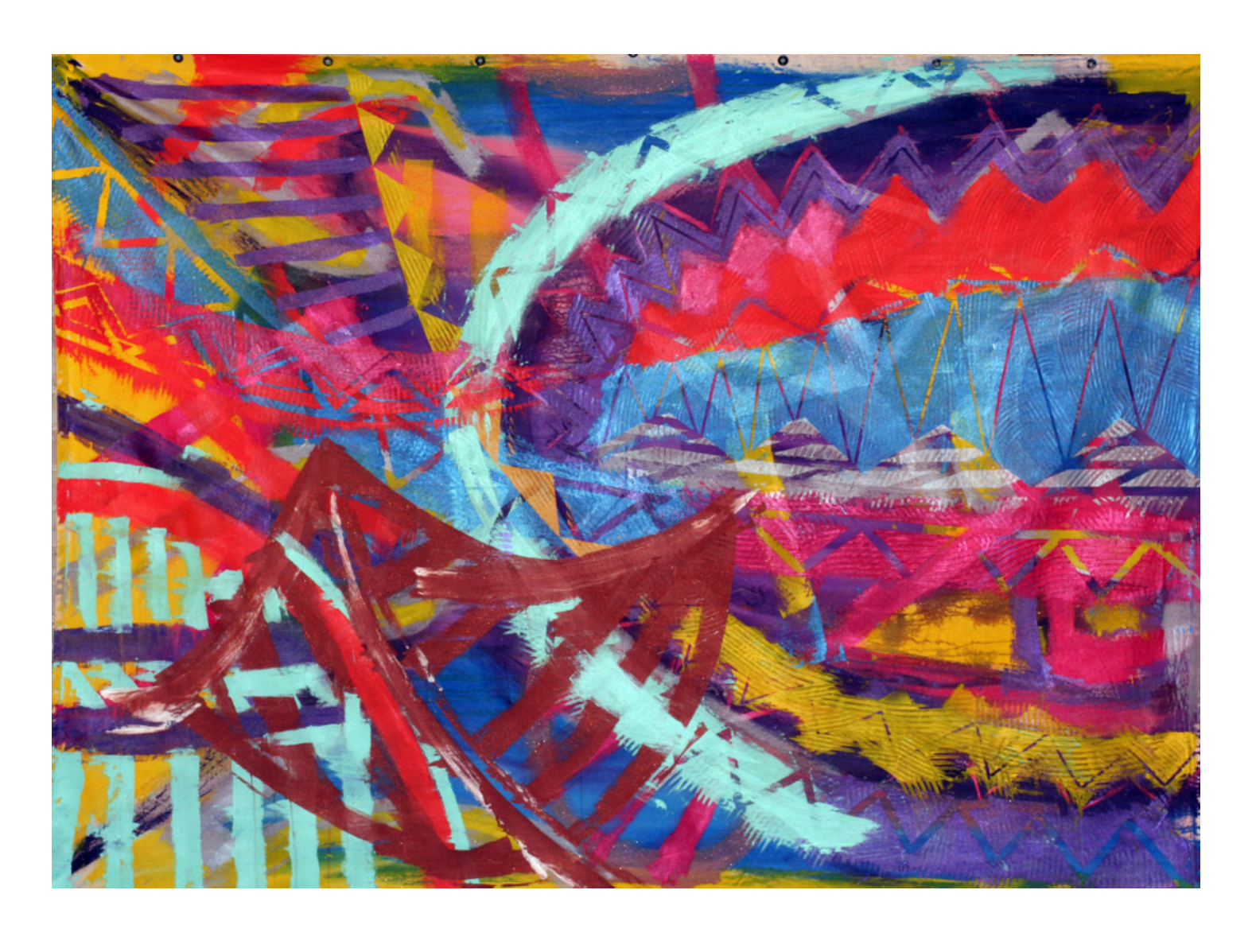
Figure 7: Mystical Afronaut, 2006, acrylic on un-stretched canvas, 66"x88"