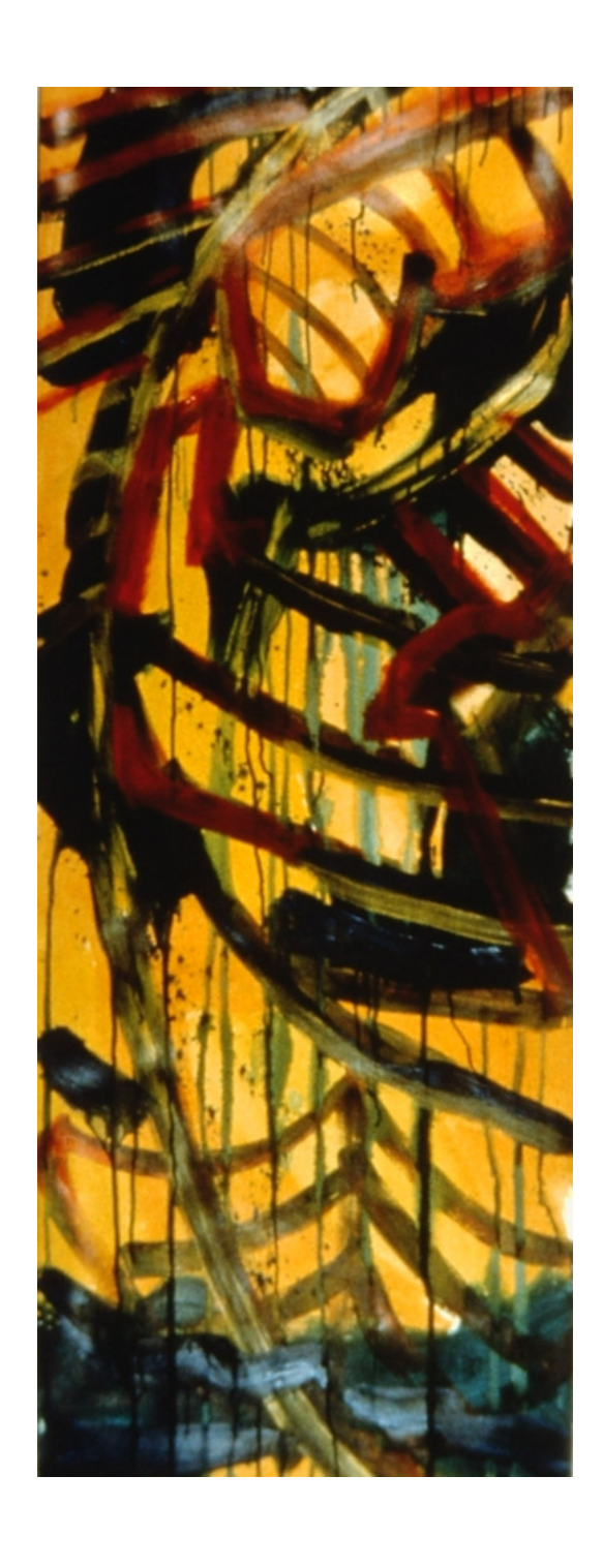
Figure 9: Thunder Skies , 1992, acrylic on paper, 60"x21"