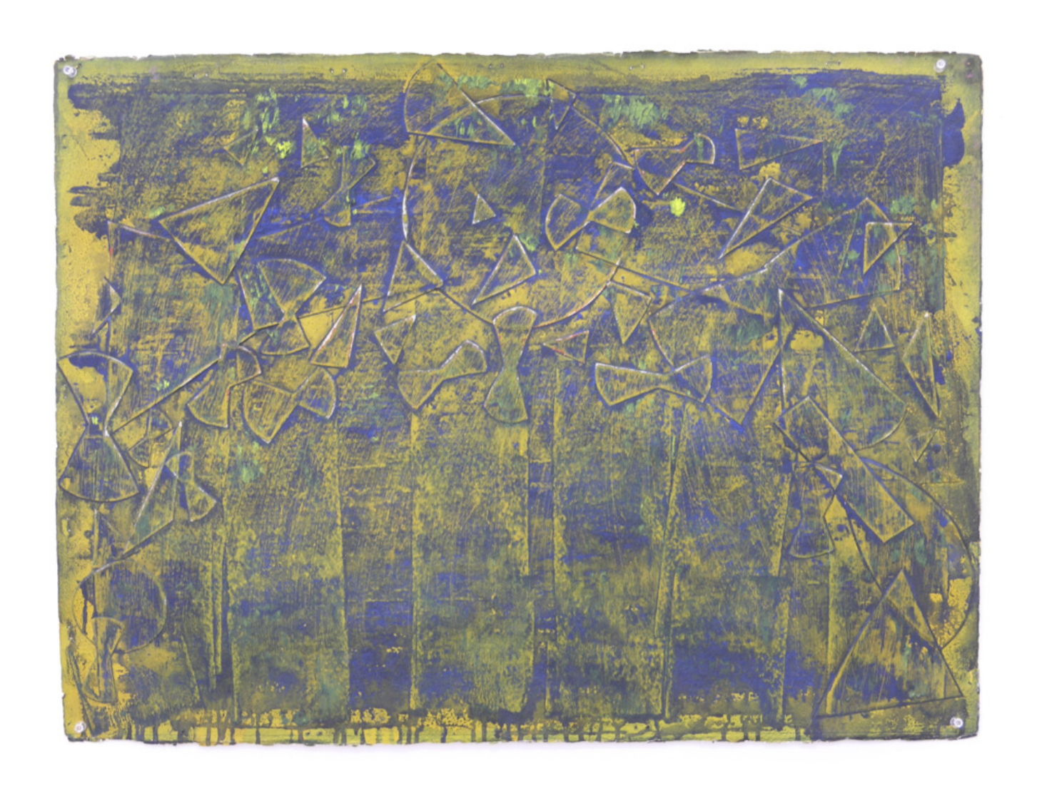
Figure 3: Cosmic Xango, 1978, mixed media collage on 300lb watercolor paper, 23"x30"