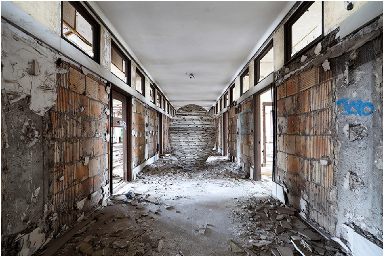
The Egg and Michigan Central Train Station #4718, 2007-2013, Site-specific installation using discarded marble