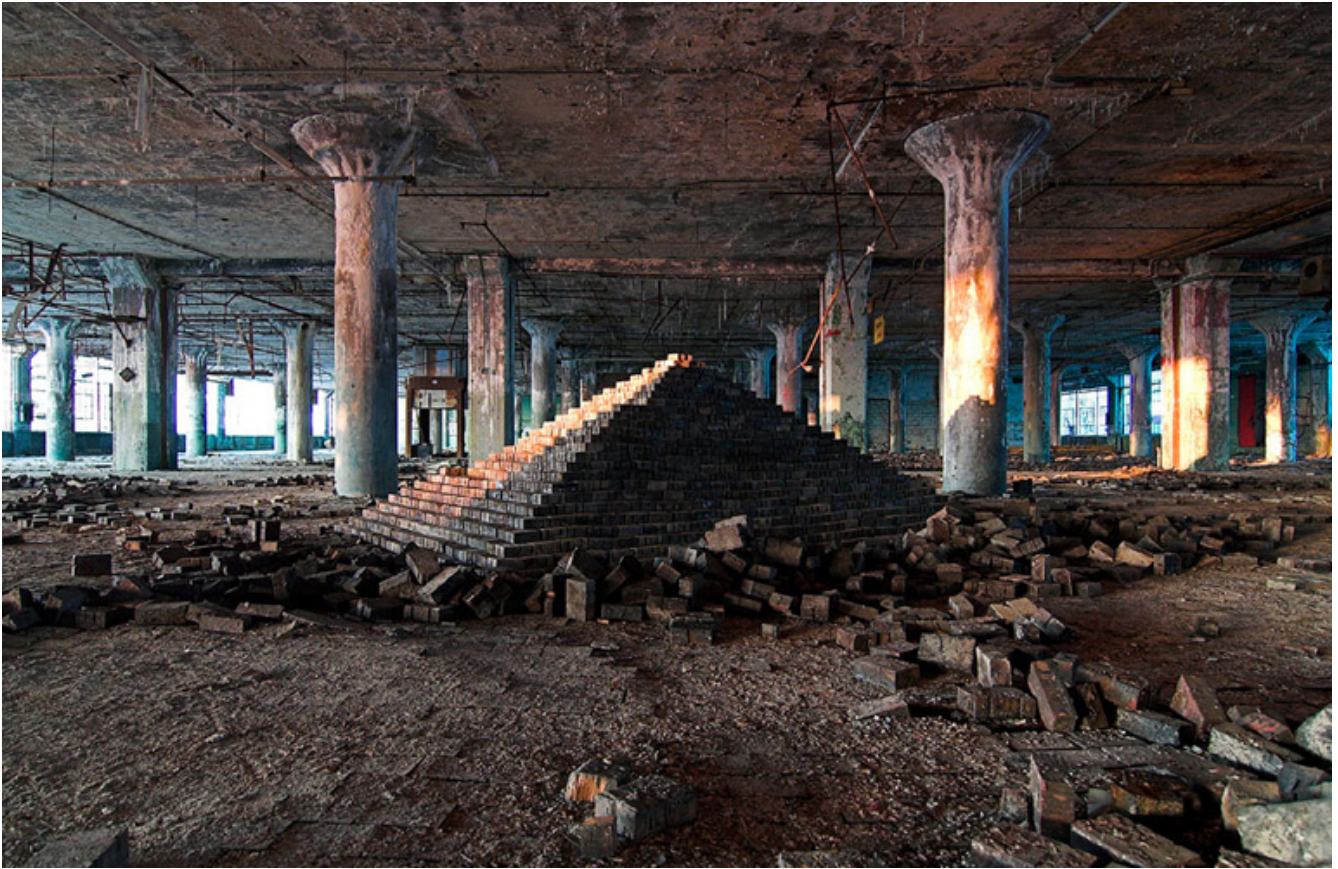
Ziggurat, Dusk, Mid-build, 2007-2009, Site-specific installation using discarded industrial floor blocks