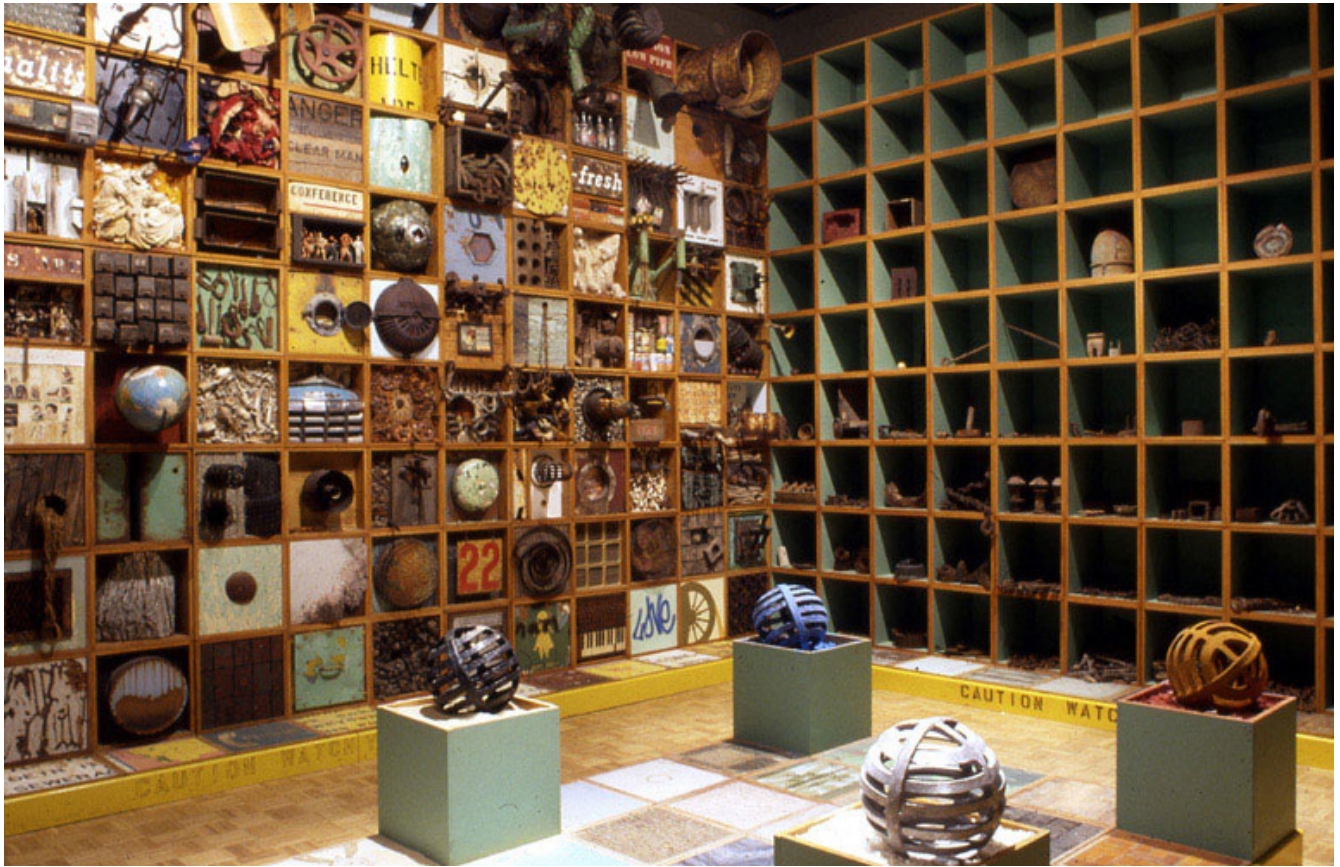
Relics, 2001-2013, Installation View, Detroit Institute of the Arts, 2001