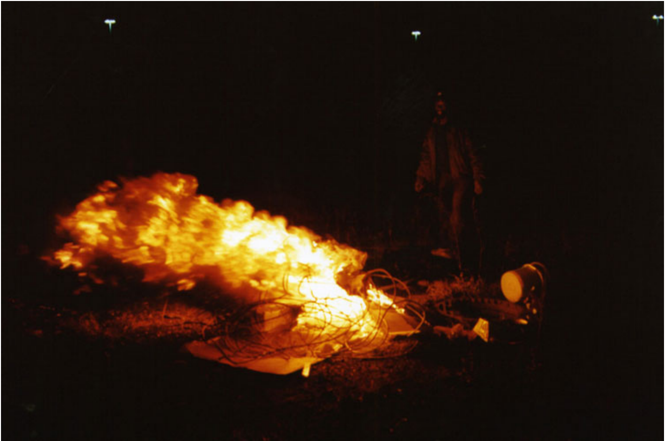
Country Boy's Fire, from the "Scrappers" series 2000-2004