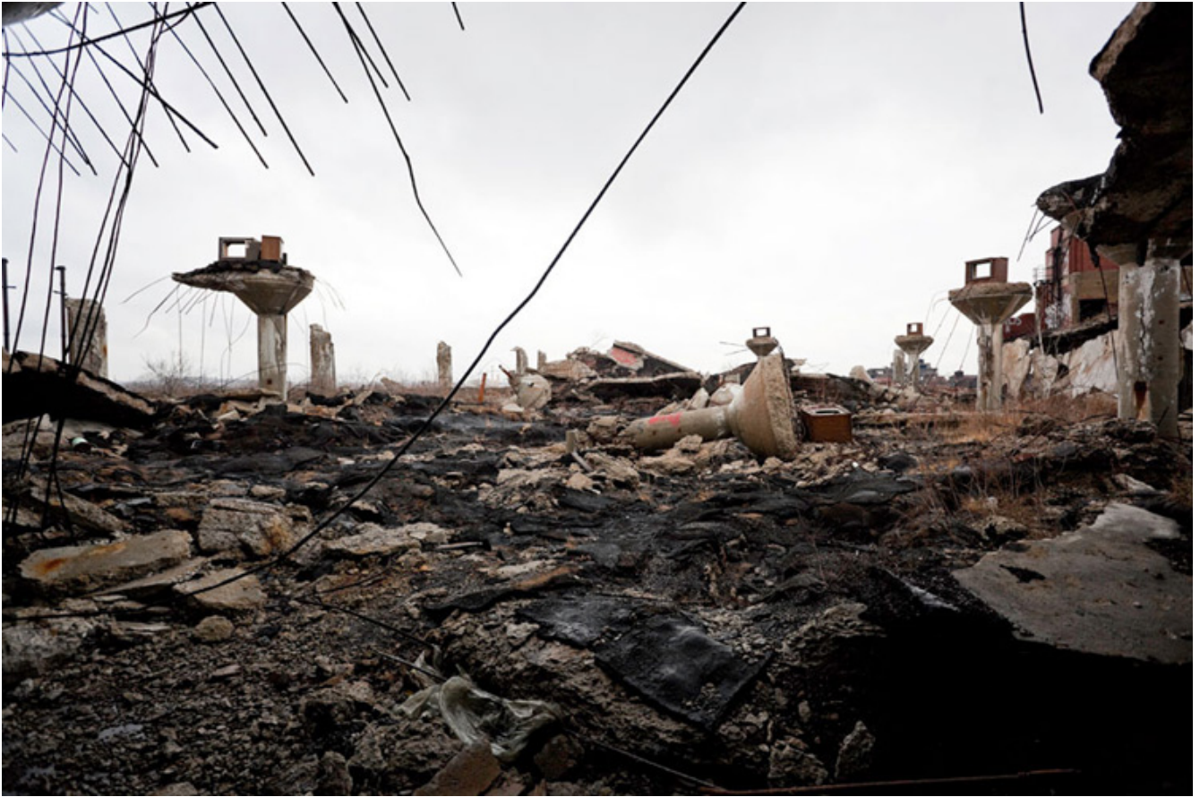
Garden of the Gods, North, Winter, 2009-2011, Site-specific installation