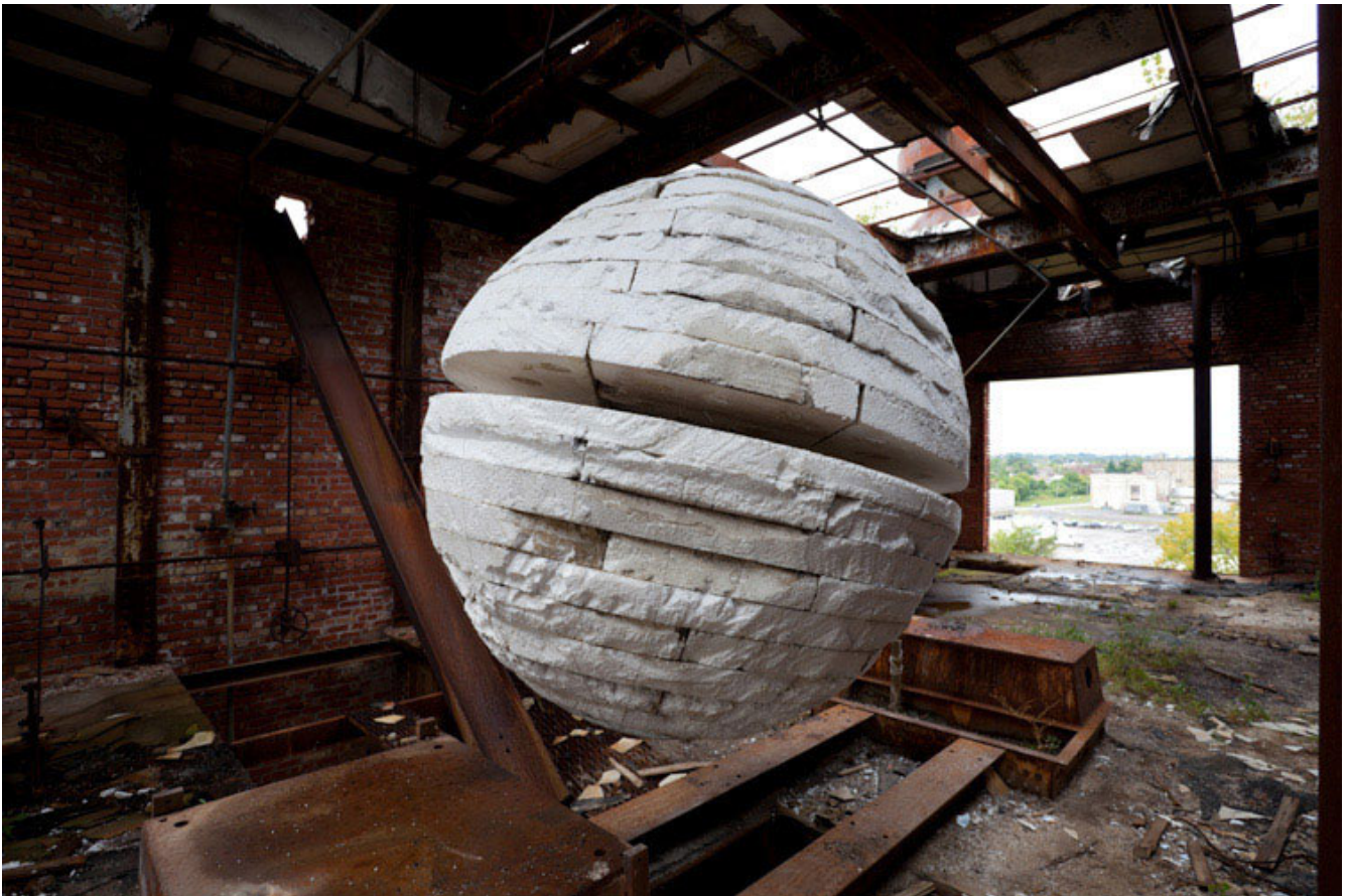
Sisyphus and the Voice of Space , 2010, Site-specific installation using discarded polystyrene